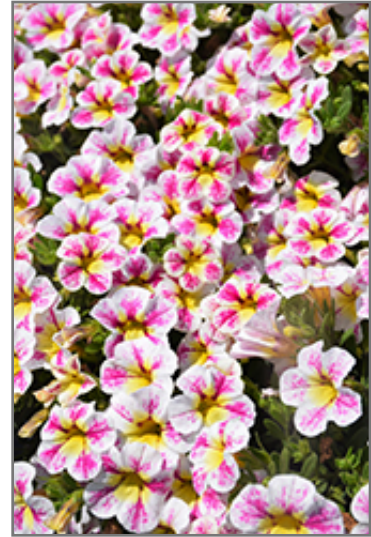
Superbells Holy Cow! Calibrachoa flowers

Superbells Holy Cow! Calibrachoa is a dense herbaceous annual with a trailing habit of growth, eventually spilling over the edges of hanging baskets and containers. Its medium texture blends into the garden, but can always be balanced by a couple of finer or coarser plants for an effective composition.