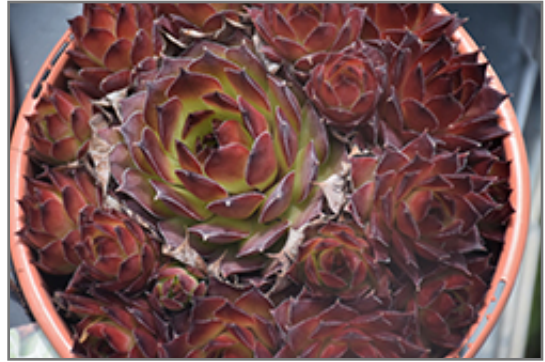
Black Hens And Chicks

Black Hens And Chicks is a fine choice for the garden, but it is also a good selection for planting in outdoor pots and containers. It is often used as a 'filler' in the 'spiller-thriller-filler' container combination, providing a canvas of foliage against which the larger thriller plants stand out. Note that when growing plants in outdoor containers and baskets, they may require more frequent waterings than they would in the yard or garden.