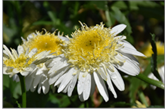
Realflor Real Glory Shasta Daisy flowers

Realflor Real Glory Shasta Daisy is recommended for the following landscape applications;