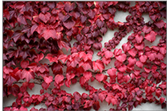
Veitch Boston Ivy in fall