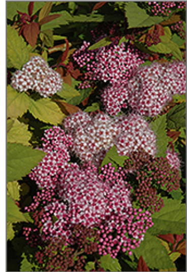
Double Play Big Bang Spirea flowers

Double Play Big Bang Spirea is recommended for the following landscape applications;