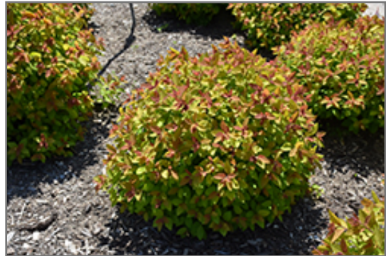
Double Play Big Bang Spirea