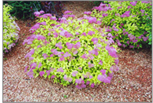
Goldmound Spirea in bloom

This shrub should only be grown in full sunlight. It prefers to grow in average to moist conditions, and shouldn't be allowed to dry out. It is not particular as to soil type or pH. It is highly tolerant of urban pollution and will even thrive in inner city environments. This is a selected variety of a species not originally from North America.