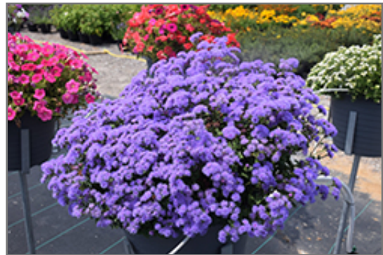
Artist Blue Flossflower in bloom