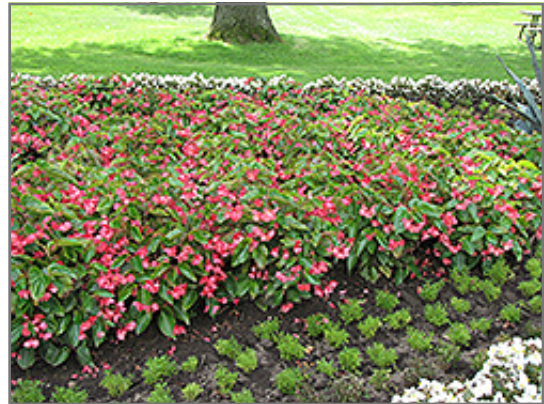
Dragon Wing Pink Begonia in bloom

Dragon Wing Pink Begonia is a fine choice for the garden, but it is also a good selection for planting in outdoor containers and hanging baskets. It is often used as a 'filler' in the 'spiller-thriller-filler' container combination, providing a mass of flowers and foliage against which the thriller plants stand out. Note that when growing plants in outdoor containers and baskets, they may require more frequent waterings than they would in the yard or garden.