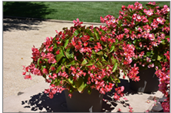
Dragon Wing Pink Begonia flowers