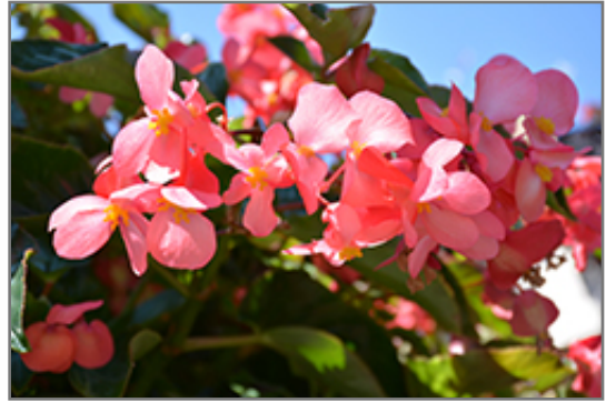
Dragon Wing Pink Begonia flowers

This is a high maintenance plant that will require regular care and upkeep, and usually looks its best without pruning, although it will tolerate pruning. Deer don't particularly care for this plant and will usually leave it alone in favor of tastier treats. Gardeners should be aware of the following characteristic(s) that may warrant special consideration;