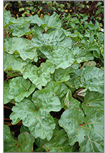
Valentine Rhubarb foliage

This is an herbaceous perennial with a rigidly upright and towering form. Its wonderfully bold, coarse texture can be very effective in a balanced garden composition. This plant will require occasional maintenance and upkeep, and can be pruned at anytime. Deer don't particularly care for this plant and will usually leave it alone in favor of tastier treats. It has no significant negative characteristics.