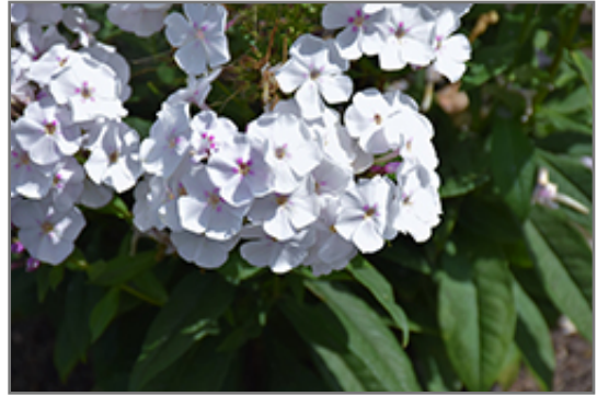
Garden Girls Party Girl Garden Phlox flowers

Garden Girls Party Girl Garden Phlox is recommended for the following landscape applications;