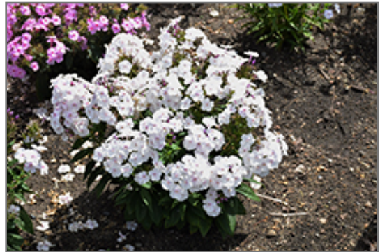
Garden Girls Party Girl Garden Phlox in bloom