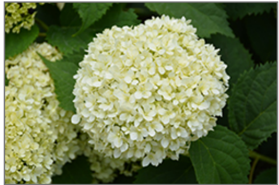
Lime Rickey Smooth Hydrangea flowers