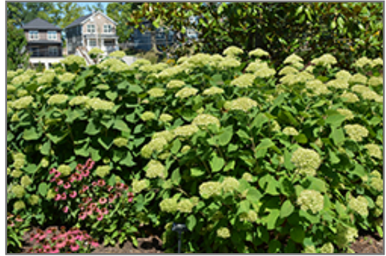
Lime Rickey Smooth Hydrangea in bloom