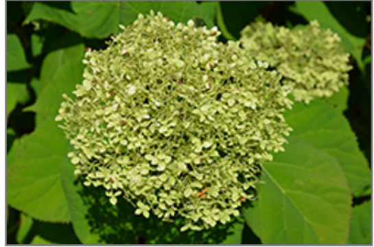
Lime Rickey Smooth Hydrangea flowers (faded)

This shrub does best in full sun to partial shade. You may want to keep it away from hot, dry locations that receive direct afternoon sun or which get reflected sunlight, such as against the south side of a white wall. It prefers to grow in average to moist conditions, and shouldn't be allowed to dry out. It is not particular as to soil type or pH. It is highly tolerant of urban pollution and will even thrive in inner city environments. Consider applying a thick mulch around the root zone in winter to protect it in exposed locations or colder microclimates. This is a selection of a native North American species.