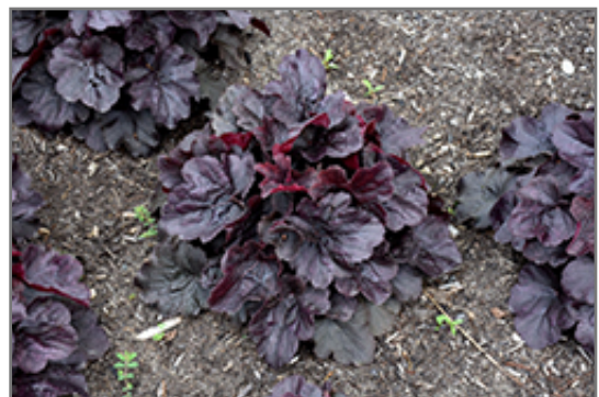
Northern Exposure Black Coral Bells