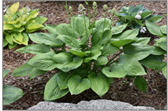
Blue Hawaii Hosta

Blue Hawaii Hosta is recommended for the following landscape applications;