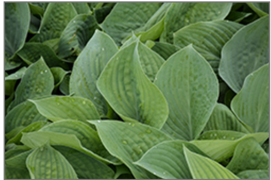
Blue Hawaii Hosta foliage