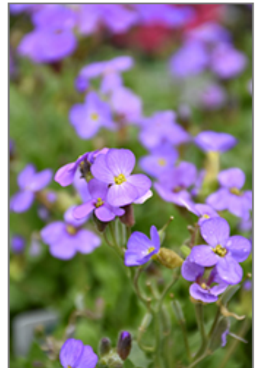
Cascade Blue Rock Cress flowers