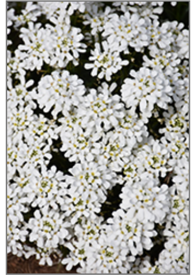
Snowsation Candytuft flowers