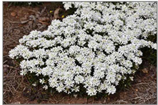
Snowsation Candytuft in bloom