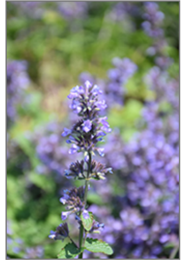
Cat's Pajamas Catmint flowers

Cat's Pajamas Catmint is recommended for the following landscape applications;