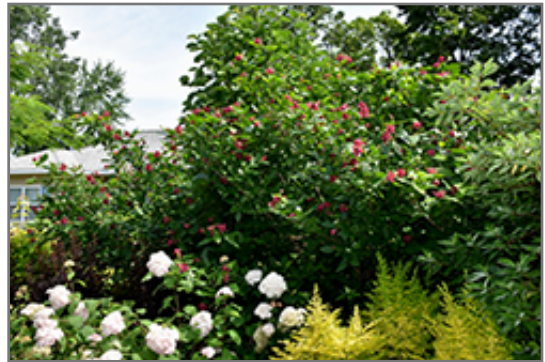
Aphrodite Sweetshrub in bloom