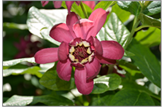
Aphrodite Sweetshrub flowers