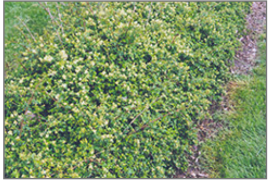
Cutleaf Stephanandra

Cutleaf Stephanandra will grow to be about 5 feet tall at maturity, with a spread of 5 feet. It tends to fill out right to the ground and therefore doesn't necessarily require facer plants in front, and is suitable for planting under power lines. It grows at a fast rate, and under ideal conditions can be expected to live for approximately 20 years.