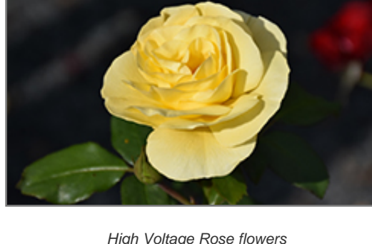
High Voltage Rose flowers