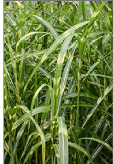
Super Stripe Maiden Grass foliage