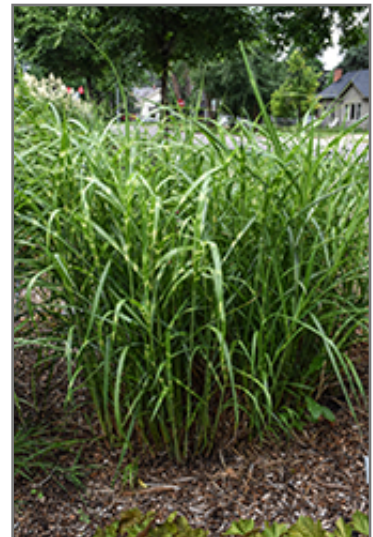
Super Stripe Maiden Grass