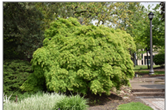
Green Laceleaf Japanese Maple