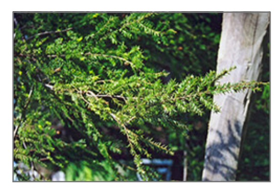
Eastern Hemlock foliage