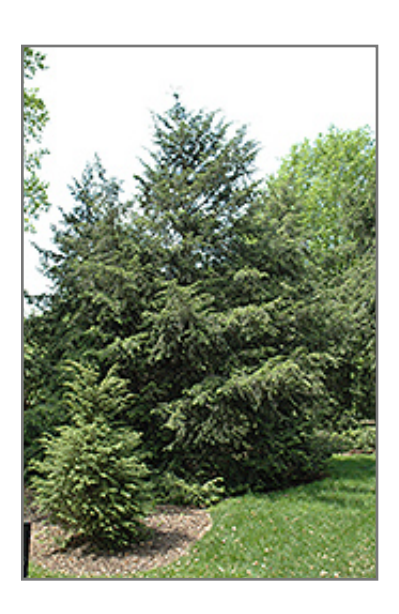
Eastern Hemlock