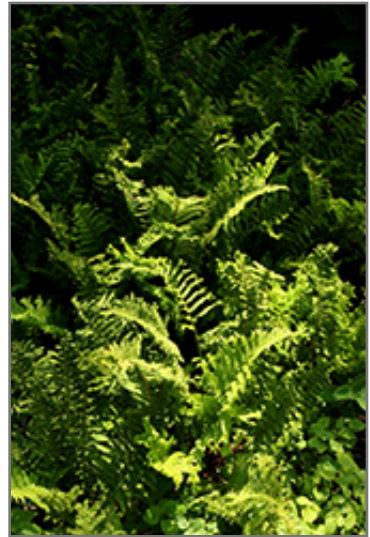
Lady Fern foliage