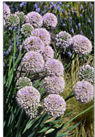
Bubble Bath Ornamental Onion flowers