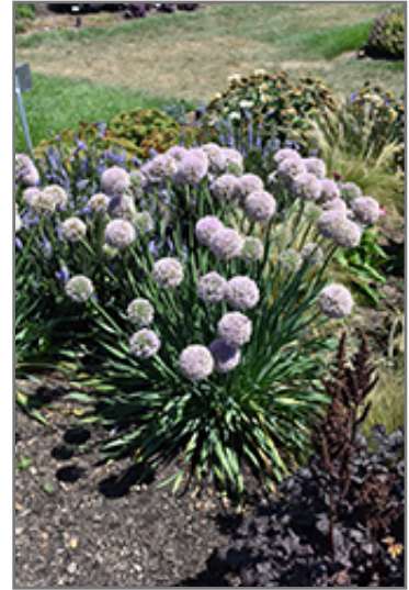
Bubble Bath Ornamental Onion in bloom

Bubble Bath Ornamental Onion is recommended for the following landscape applications;