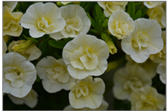
Superbells Double Chiffon Calibrachoa flowers