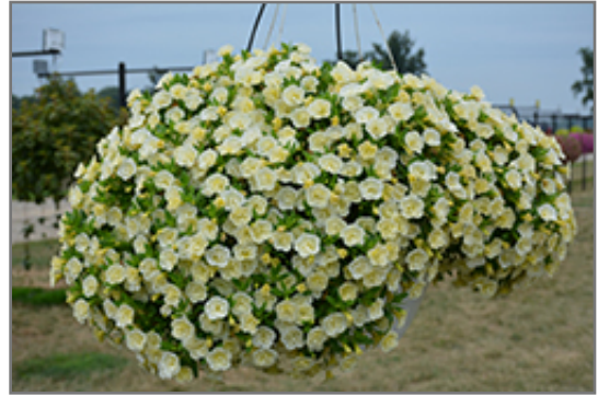
Superbells Double Chiffon Calibrachoa in bloom