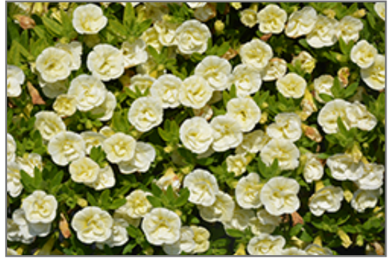
Superbells Double Chiffon Calibrachoa flowers

Superbells Double Chiffon Calibrachoa is a dense herbaceous annual with a trailing habit of growth, eventually spilling over the edges of hanging baskets and containers. Its medium texture blends into the garden, but can always be balanced by a couple of finer or coarser plants for an effective composition.