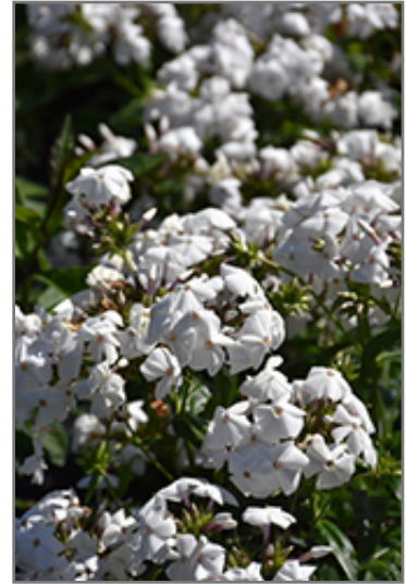
Opening Act White Phlox flowers

Opening Act White Phlox is recommended for the following landscape applications;