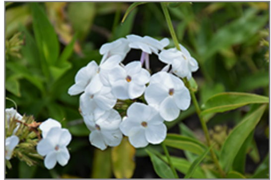
Opening Act White Phlox flowers