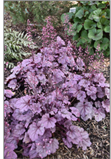
Pink Panther Coral Bells in bloom

Pink Panther Coral Bells is recommended for the following landscape applications;