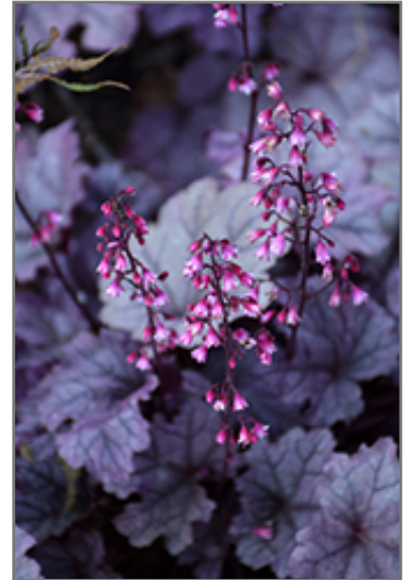
Pink Panther Coral Bells flowers

Pink Panther Coral Bells is a fine choice for the garden, but it is also a good selection for planting in outdoor pots and containers. With its upright habit of growth, it is best suited for use as a 'thriller' in the 'spiller-thriller-filler' container combination; plant it near the center of the pot, surrounded by smaller plants and those that spill over the edges. Note that when growing plants in outdoor containers and baskets, they may require more frequent waterings than they would in the yard or garden.