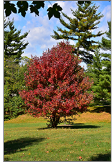
Redpointe Red Maple in fall

This tree should only be grown in full sunlight. It is quite adaptable, preferring to grow in average to wet conditions, and will even tolerate some standing water. It is not particular as to soil type, but has a definite preference for acidic soils, and is subject to chlorosis (yellowing) of the foliage in alkaline soils. It is somewhat tolerant of urban pollution. This is a selection of a native North American species.