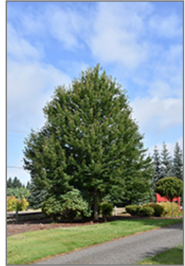
Redpointe Red Maple