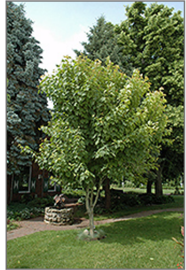
Striped Maple