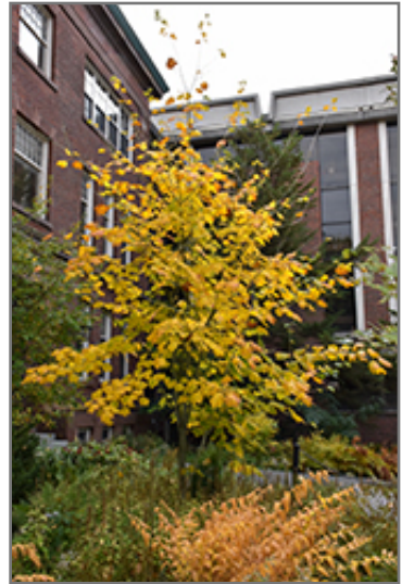
Striped Maple in fall