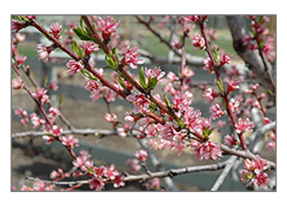
Redhaven Peach flowers