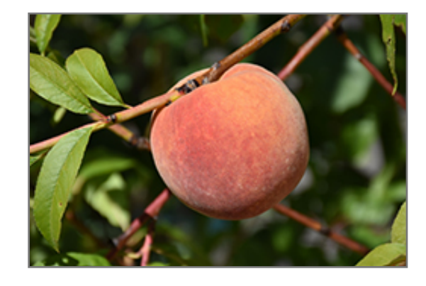
Redhaven Peach fruit

Redhaven Peach is covered in stunning clusters of fragrant pink flowers along the branches in early spring, which emerge from distinctive rose flower buds before the leaves. It has dark green deciduous foliage. The narrow leaves turn yellow in fall. The fruits are showy yellow drupes with a red blush, which are carried in abundance in mid summer. The fruit can be messy if allowed to drop on the lawn or walkways, and may require occasional clean-up.