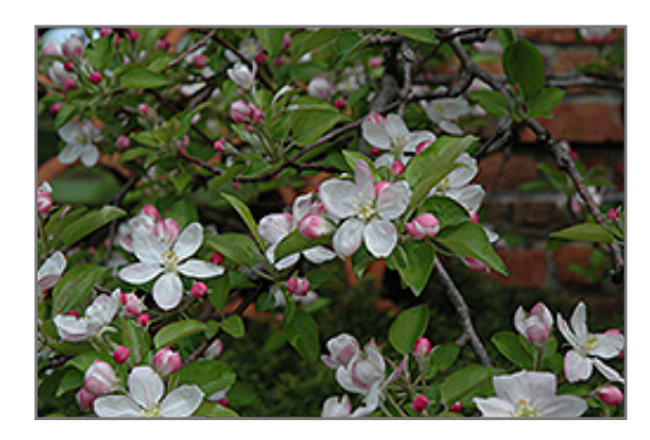
Golden Delicious Apple flowers