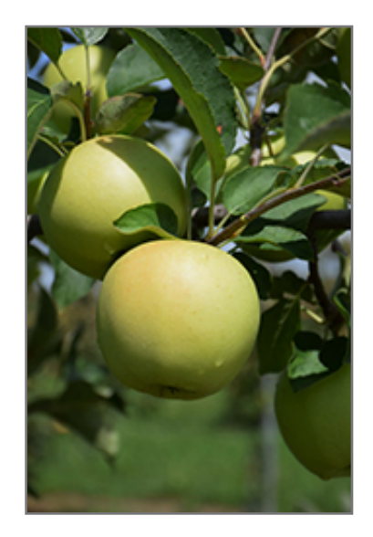
Golden Delicious Apple fruit

Golden Delicious Apple features showy clusters of lightly-scented white flowers with shell pink overtones along the branches in mid spring, which emerge from distinctive pink flower buds. It has forest green deciduous foliage. The pointy leaves turn yellow in fall. The fruits are showy chartreuse apples with yellow overtones, which are carried in abundance in mid fall. The fruit can be messy if allowed to drop on the lawn or walkways, and may require occasional clean-up.